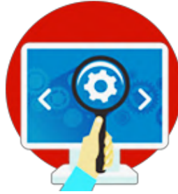
QA & TESTING