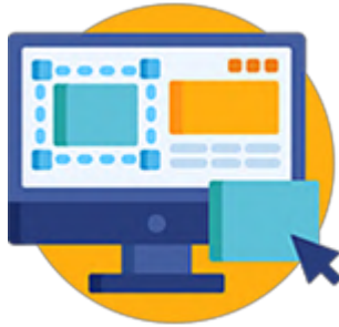
UI / UX DESIGN