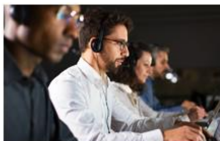
Call Center Ops